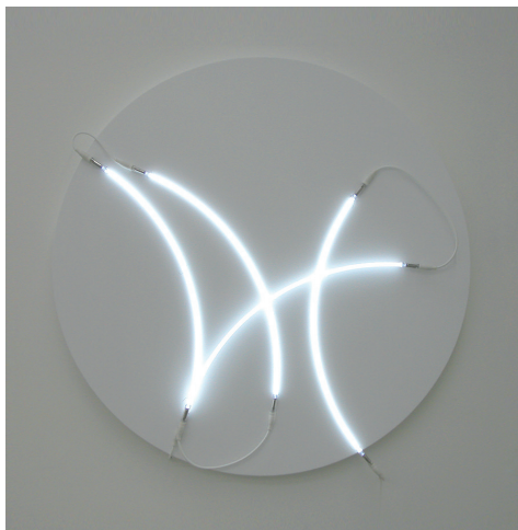
Lunatique Neonly, n°10, 2002 - 121 x 120cm